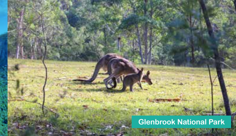
Glenbrook National Park

Fill your day your way with sightseeing, charming village strolls, and cosy dining plus your choice of activities.